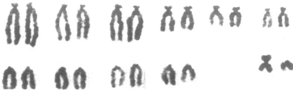
FIGURE 3. Karyotype of Didelphis virginiana (Louisiana State Univ. 13393, male from Edinburg, Hidalgo County, Texas).

While feigning death, opossums become immobile, usually with the mouth open, and lie with a ventral flexion of the body and tail. Sensitivity to tactile stimulation is much reduced, although the animals do respond weakly to sudden, low-pitched sounds. Catatonia might be brief, lasting less than a minute, or as long as 2 to 6 hr (Wiedorn, 1954). Using EKG techniques, Francq (1970) was unable to distinguish between catatonic heart activity and that during the active state.